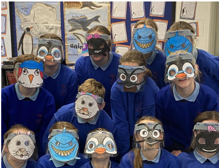
We created dramas based on our creative writing.