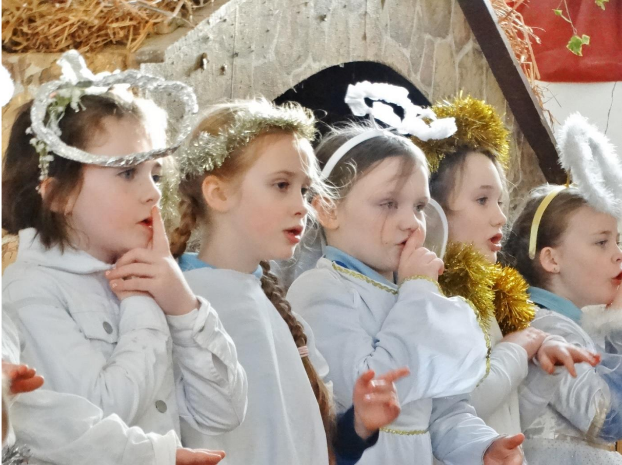
Our Infant Classes Performed the Christmas Nativity in St. Kilian's Church during the Week.