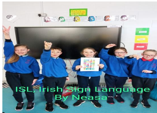
ISL, Irish Sign Language By Neasa