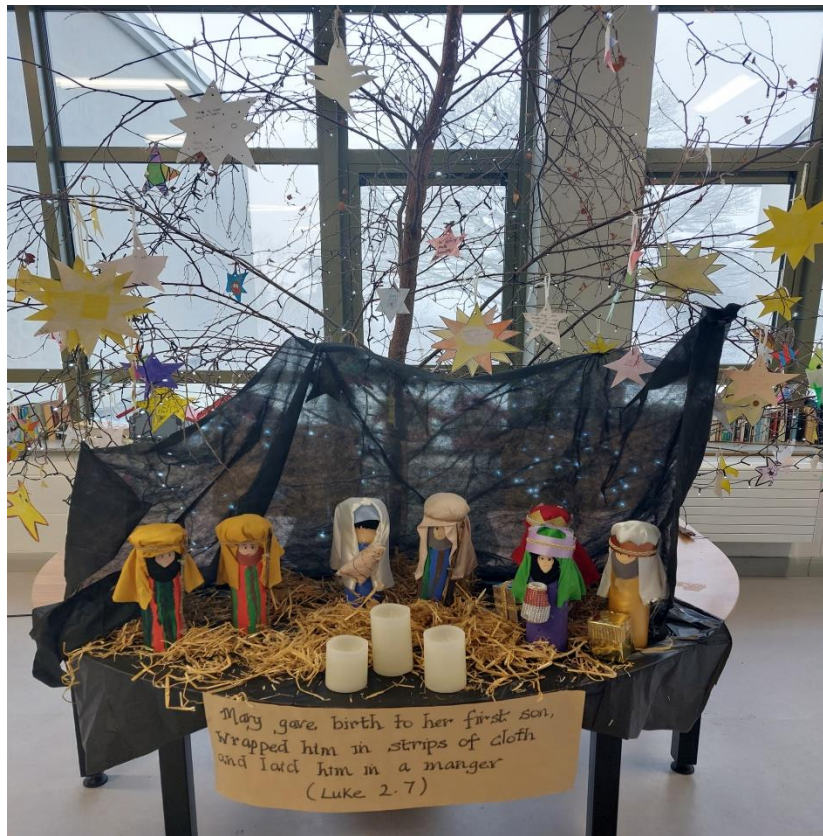
Our Senior Classes' Nativity Scene.

Our school is proud of its ethos and the Christian values that we cherish and try to live by in our daily work. Christmas is a significant time in our school calendar and the message of love and hope that we hear in the Christmas story is one that we hold dear, especially in challenging times like those we continue to live through. The pupils once again this Advent decorated our trees with individual stars designed by them and displaying an act of kindness they have performed.