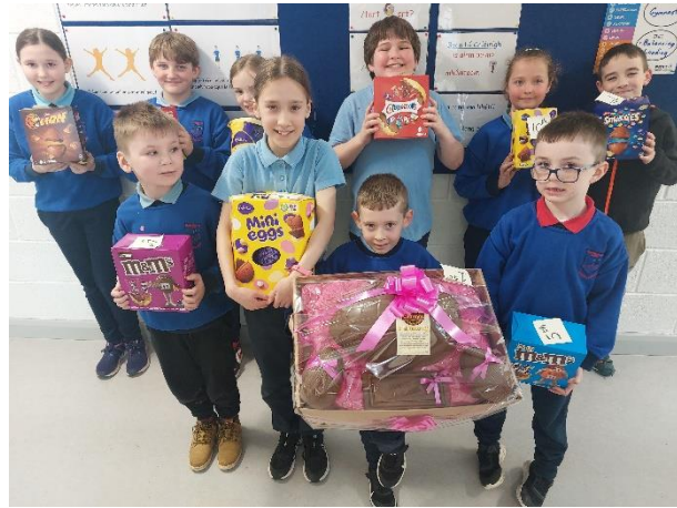
All the Prize Winners

A big thank you to all who organised this very successful draw and all who took part.