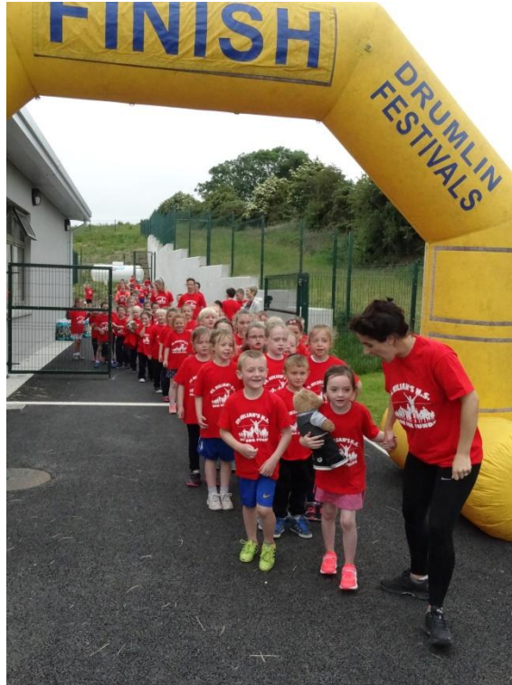
Still running after all these years!