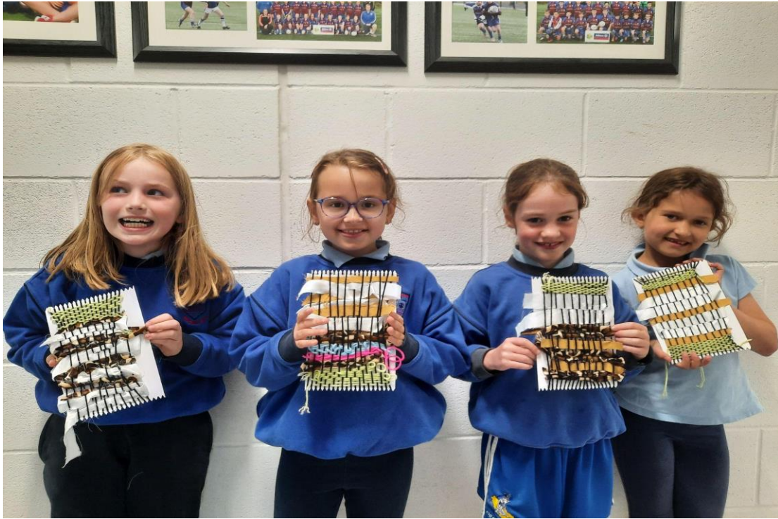
6 th Class, Down Memory Lane

First Class have worked so hard this year and we intend to weave our way to the holidays...literally!