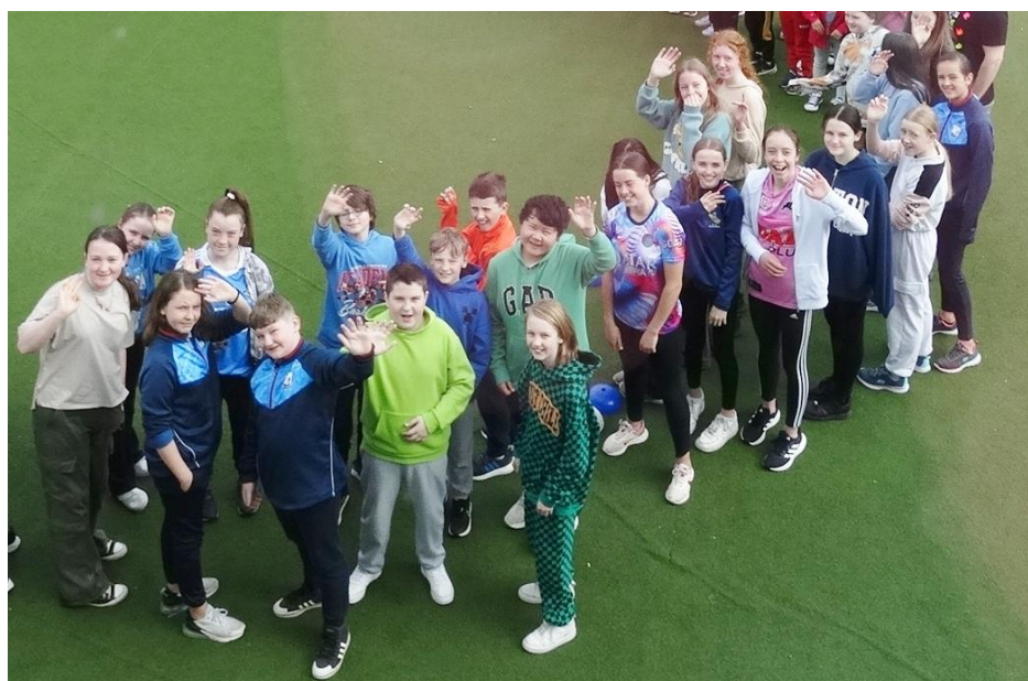
And it's goodbye from us!