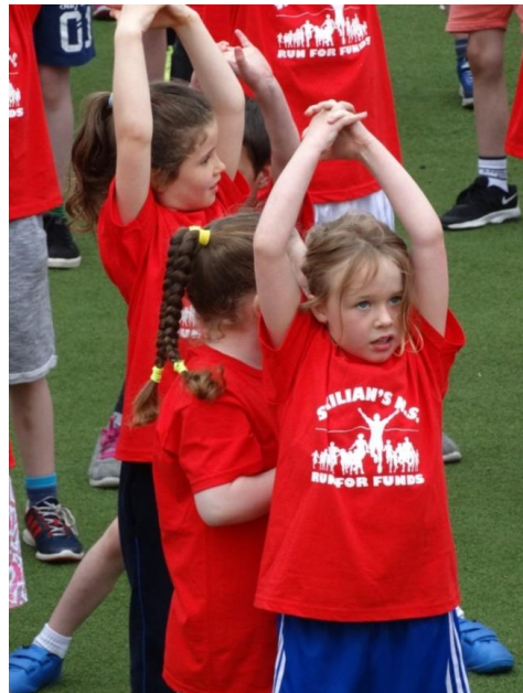
Look What We Can Do!