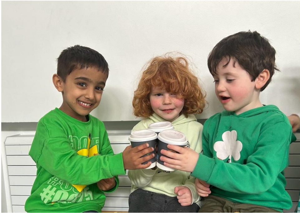
The lads enjoyed a well-earned 'cuppa'.