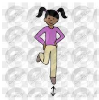
Hop on one foot!

Preabaigí ar leathchois, ar dheis ar dtús, anois ar chlé.