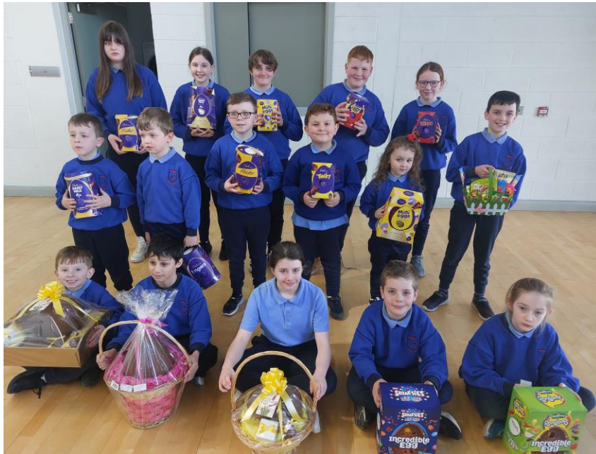
Easter Egg Winners. Well done all!