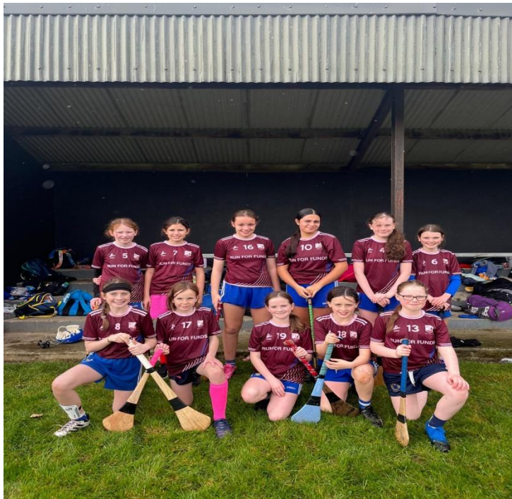
Our girls camogie team who took part in a blitz recently in Virginia.

Signed _____ . _____ . Chairperson BOM. Secretary BOM.