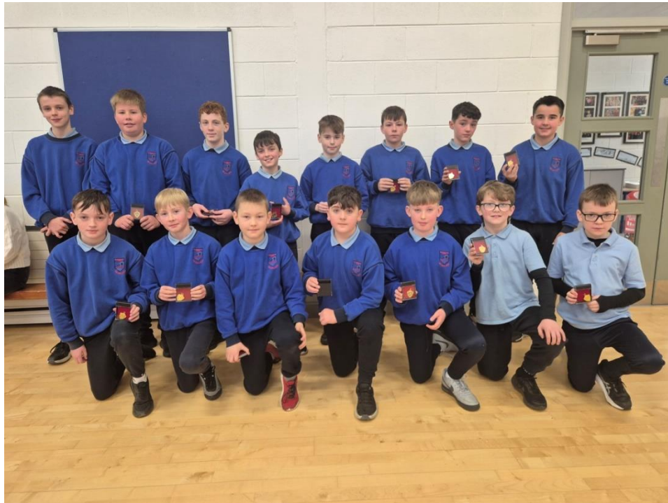
Our boys were presented with their medals at a school assembly last week.