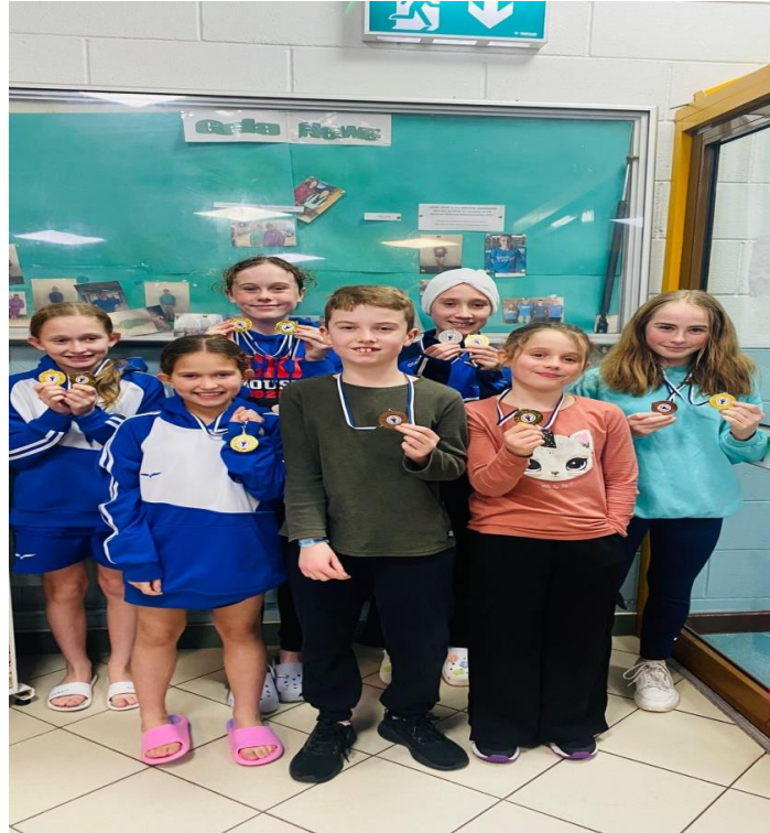
St. Kilian's N.S. swimmers who competed in the Schools Swimming Championships in Cavan Swimming Pool recently.