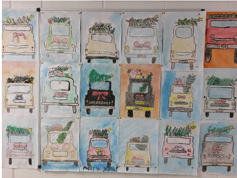
Rang 1 agus 2.